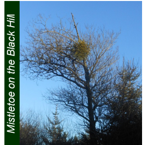
Mistletoe on the Black Hill