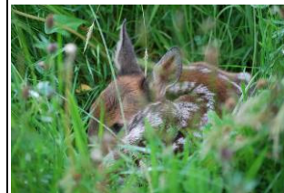
Young Roe Deer, lying in the grass.