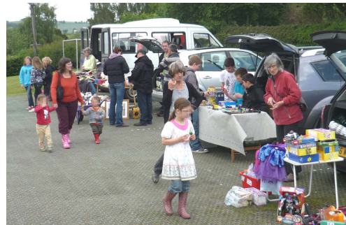
The car boot sale proved popular

Sun Shines on Summer Fair Clunbury School's first Summer Fair was blessed with a bright if blustery day and lots of families and villagers turned out to enjoy it. There were a wide variety of stalls (including a plant stall run by Barbara Freeman and helpers which alone raised over £40), a car boot sale and lots of children's games. A café run by the Clunbury Under 5s group proved to be a popular spot for people to sit and chat and enjoy the sunshine.