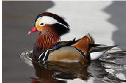
Male Mandarin Duck

On 27 April I spotted a pair of Mandarin Ducks on the Kemp by the footbridge in Kempton. The plumage of the male is beyond exotic: a fine crest, a generous ruff and two prominent 'sails', all coloured in a bold mix of orange, chestnut, green, blue, purple, gold, bronze, buff, white and black. Too exotic one might think for the UK and in fact they come from the Far East, but so