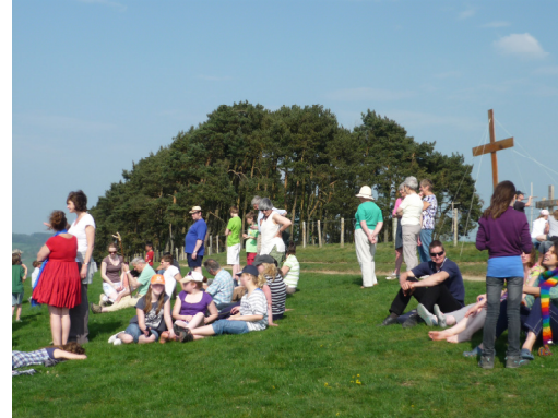
On the top of Clunbury Hill

Serving Beambridge, Clunbury, Clunton, Coston, Cwm, Kempton, Little Brampton, Obley, Purslow, The Llan and Twitchen