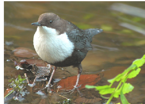
Dipper ( Cinclus cinclus )

Vince Downs talked of the successful work undertaken to provide secure nesting sites for Dippers, which are doing well at present, with nests under a number of local bridges.